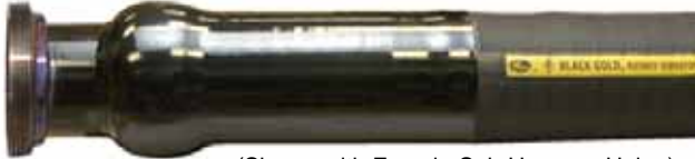
(Shown with Female Sub Hammer Union)

API 7K Coupling/Mat'l Traceability (Additional Cost) ISO 14693 Letter of Conformance (Additional Cost) Test Certificates 3rd Party Witness Test (Additional Cost) ABS/CDS Type Approval